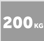
200 KG BALE WEIGHT CARDBOARD