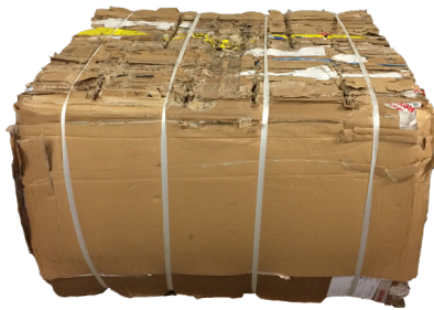
Dense mill size bale

"The latch and wheel" locking system on the lower door allows the operator to gradually open the door in a controlled way even when compacting expanding materials.