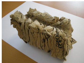
Small and compact briquette